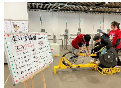
Wheelchair racer experience