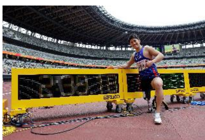
New world record in the Men's 800m (T63) by Hajime Kondo