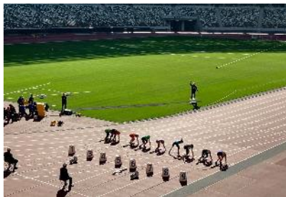
Athletes with and without disabilities racing