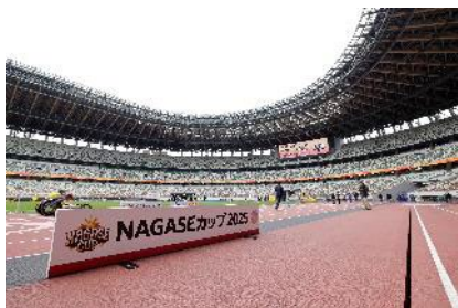
Japan National Stadium

In addition to the events, carrying on the concept from 2024 of “spreading inclusivity even further,” initiatives were enhanced to ensure both athletes and spectators could easily participate and enjoy themselves. Inside the venue, in addition to experiences continued from the previous year allowing participants to see what it is like to have a prosthetic leg or spectate with a digital device, there was a new opportunity to experience being a wheelchair racer. This provided everyone from children to adults with the chance to try the equipment used by athletes and experience with their own body diversity and inclusion through sports.